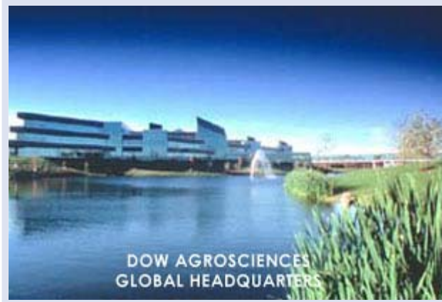
DOW AGROSCIENCES GLOBAL HEADQUARTERS